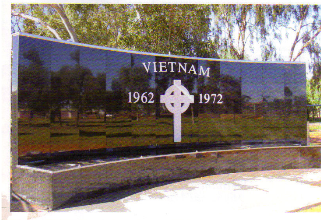
Left. The Kalgoorlie-Boulder Vietnam Veterans Memorial Dedication day was held at Centennial Park in Kalgoorlie on Sunday the 16 th August 2009. Full story page 16.