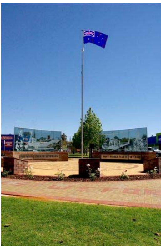
Left & Below. The Riverland Vietnam Veterans—Post World War II Veterans Memorial has officially been opened. See story in Riverland Vietnam veterans Sub branch report on page 17.