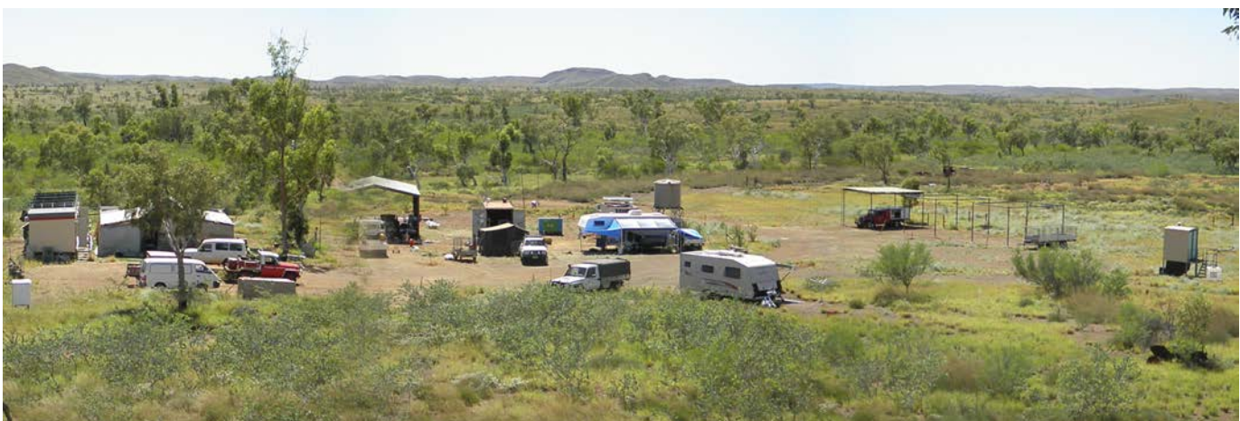
Above Retreat April, 2013.