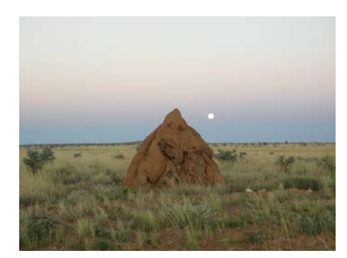
Full Moon behind a giant ant hill