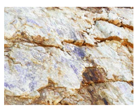
Part of the Fluorite Deposit