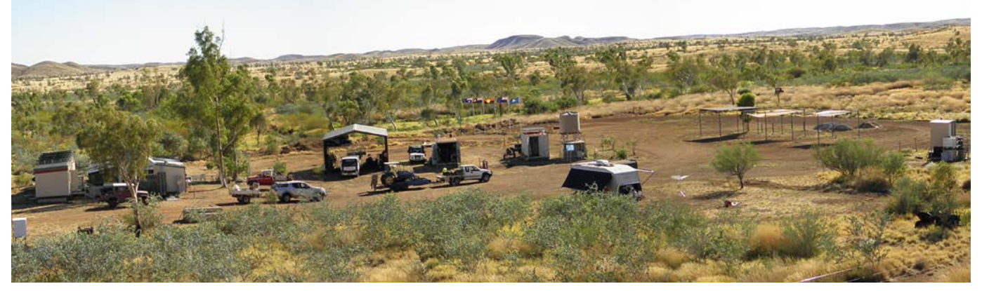
Below July 2014.