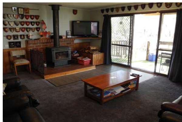
Looking towards the wood heater, new flooring in front of the heater and new position for the TV