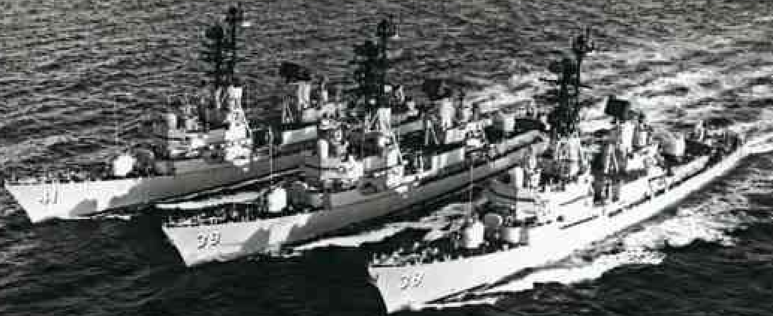
H.M.A.S. Brisbane, H.M.A.S. Hobart, H.M.A.S. Perth

HONOUR THE DEAD, But Fight like Hell for the Living