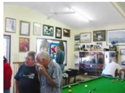
RSL entrance and inside (below)